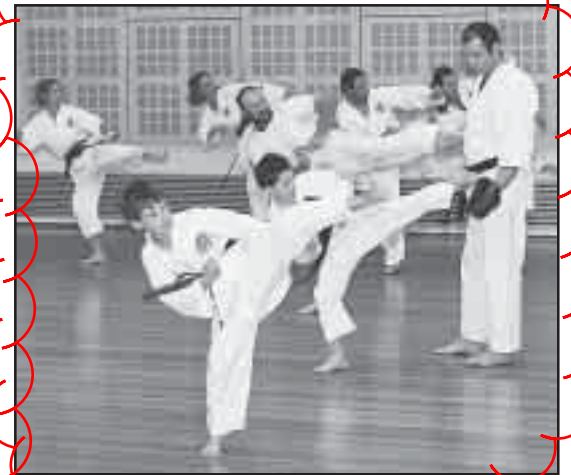
DRILLS... Local Shotokan Karate Club students strengthening leg and torso muscles through basic kicking drills. Kicking is a fundamental skill in karate which promotes balance and coordination in the body and requires extreme discipline to perfect the technique.