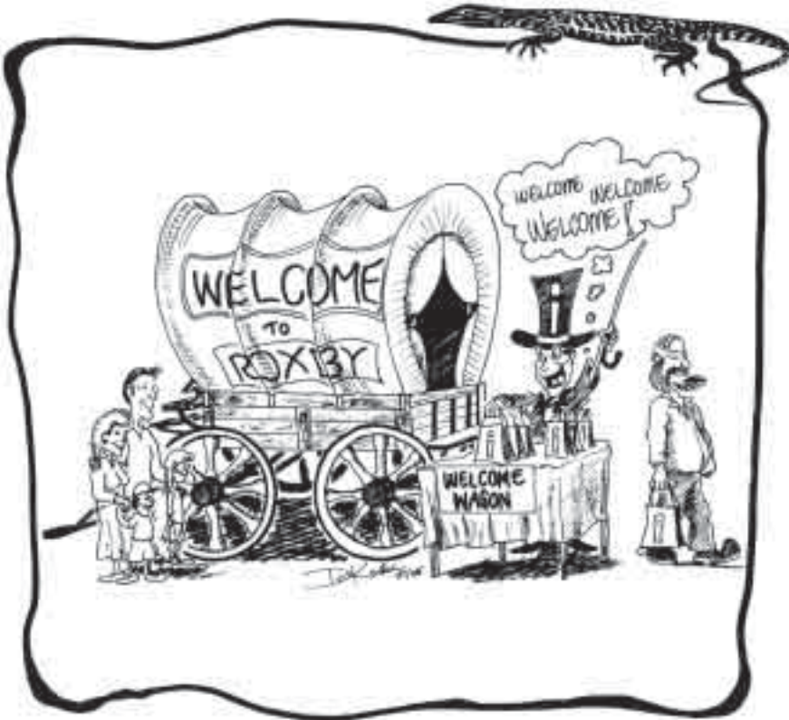
Welcome Wagon Several Community Plan initiatives will focus on strategies to welcome new Roxby Downs residents, increasing retention rates.