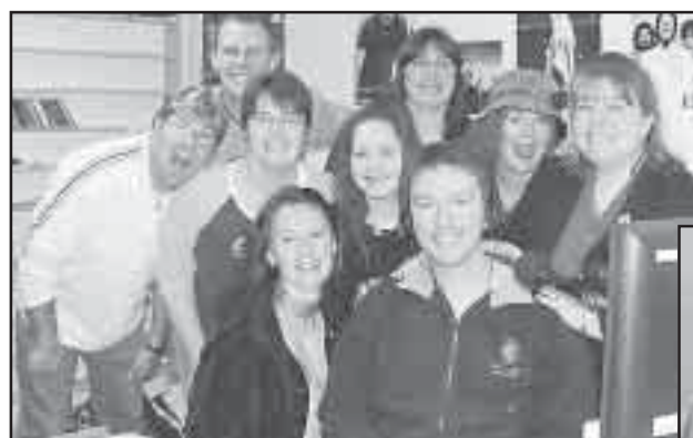
Friendly faces of RoxFM