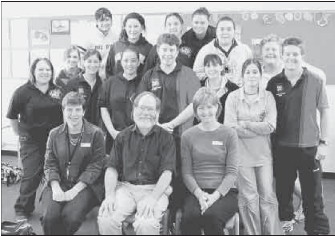
PREPARING FOR UNI... University representatives met with senior students at RDAS this month to discuss career opportunities.

A community working in partnership to pursue success, academically, socially, culturally and emotionally.