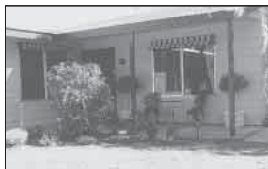
12 MIRRA ST...This Roxby Downs property offers an easy-care lifestyle.

LIN ANDREWS REAL ESTATE...Offering a very relaxed and easy care lifestyle, 12 Mirra St is a fine example of an executive home in Roxby Downs.