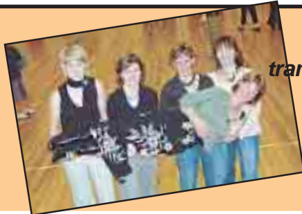
Body transformation challenge