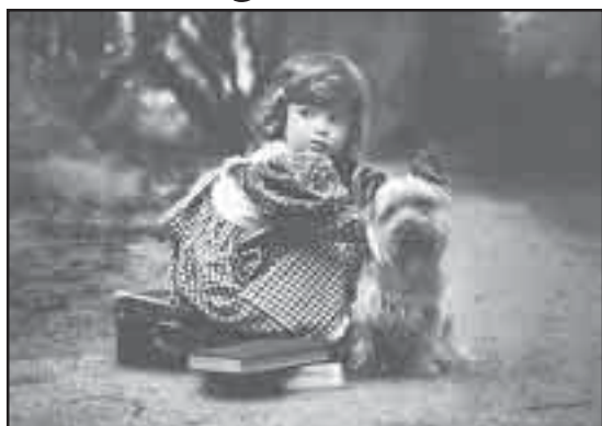
FACE PHOTOGRAPHY... Imagine your child immortalised in a unique olde-world portrait by FACE Photography.

For more information, or to book your portrait package - telephone