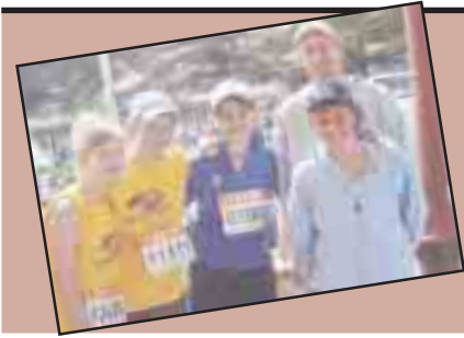
Locals join City to Bay run