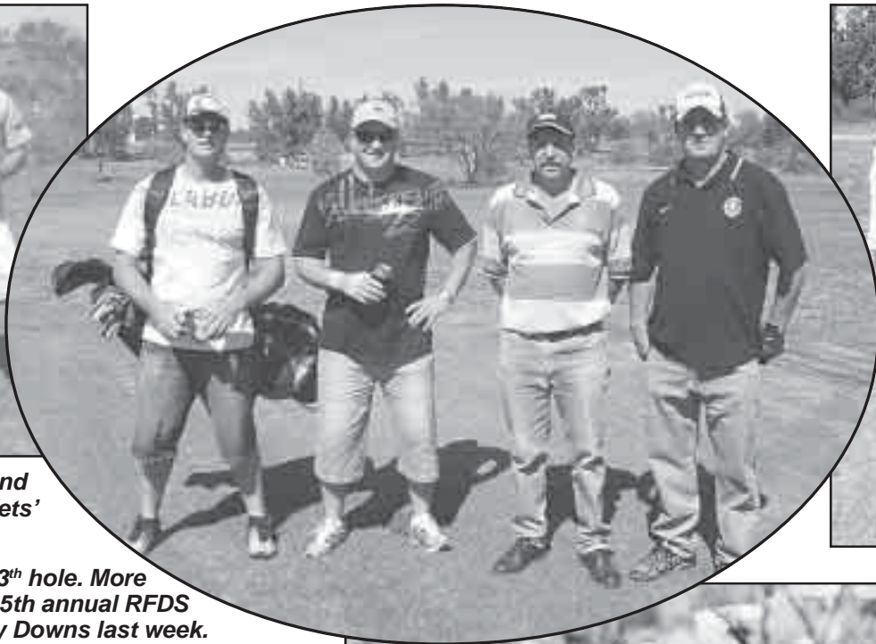
BACK NINE... Team Vaughan' on the 13 th hole. More than 80 golfers competed in the 15th annual RFDS Golf Day at Roxby Downs last week.