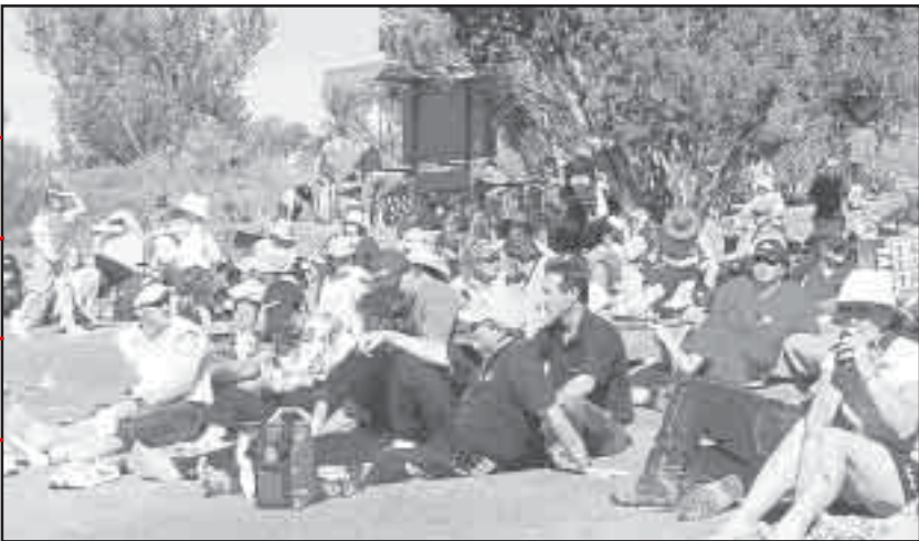
AUCTION... While crowd numbers were lower than some years, enthusiasm was high at the 15th annual Roxby Downs RFDS Auction and Golf Day.