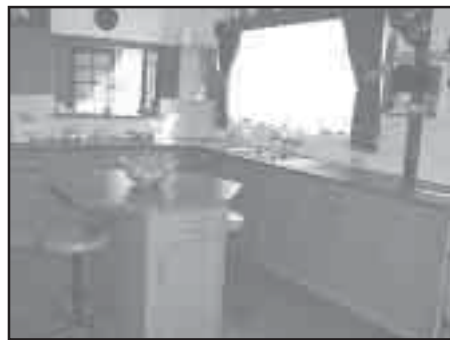
OPAL PALACE...This Andamooka home offers real Outback comfort for an investor or home-buyer.