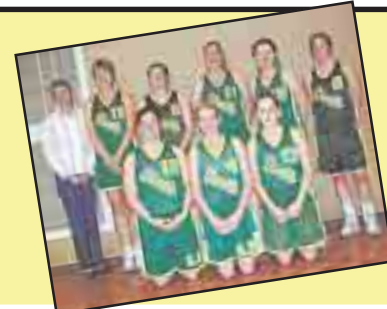
Basketball grand finals