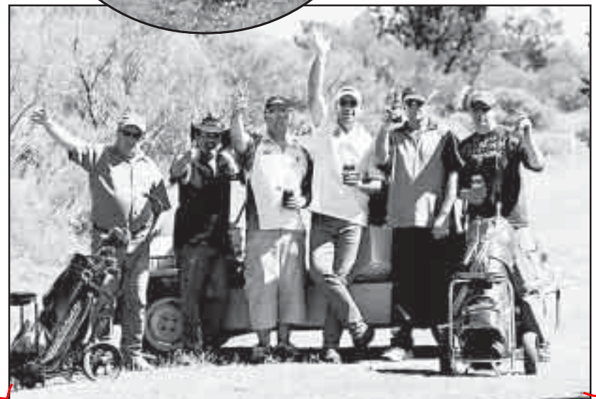
TEAM ROOS... Team Roos takes the 'back nine' in relaxed style at RFDS Golf Day on Saturday, September 17.