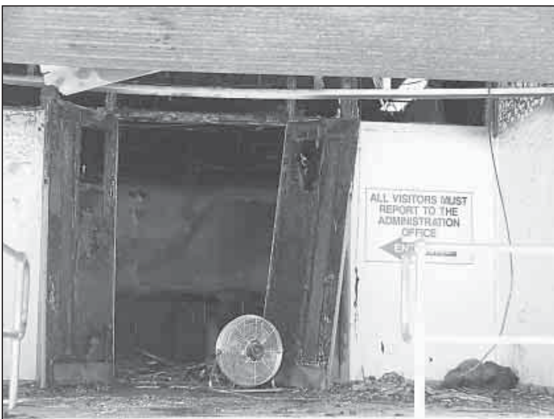
ABOVE...ANDAMOOKA...The charred remains of the entry to Andamooka Primary School.