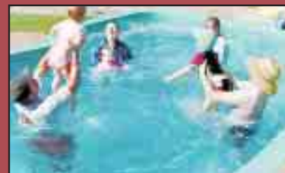
Water babies Page 19

For the latest news on all the regional sport just check The Monitor