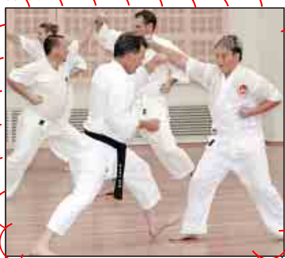
ABOVE...ROXBY DOWNS...Shotokan Karate Club members practise sparring.