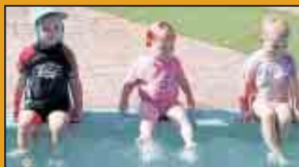
Water babies Page 19

For the latest news on all the regional sport just check The Monitor