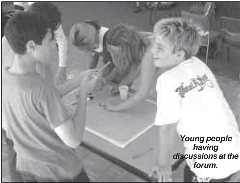
Young people having discussions at the forum.