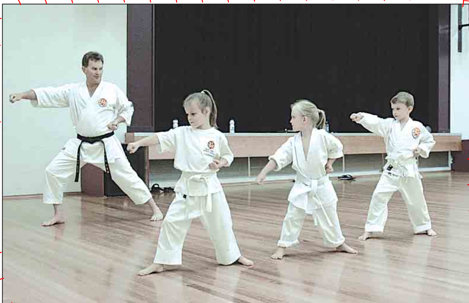
ROXBY DOWNS: Shotokan Karate Club